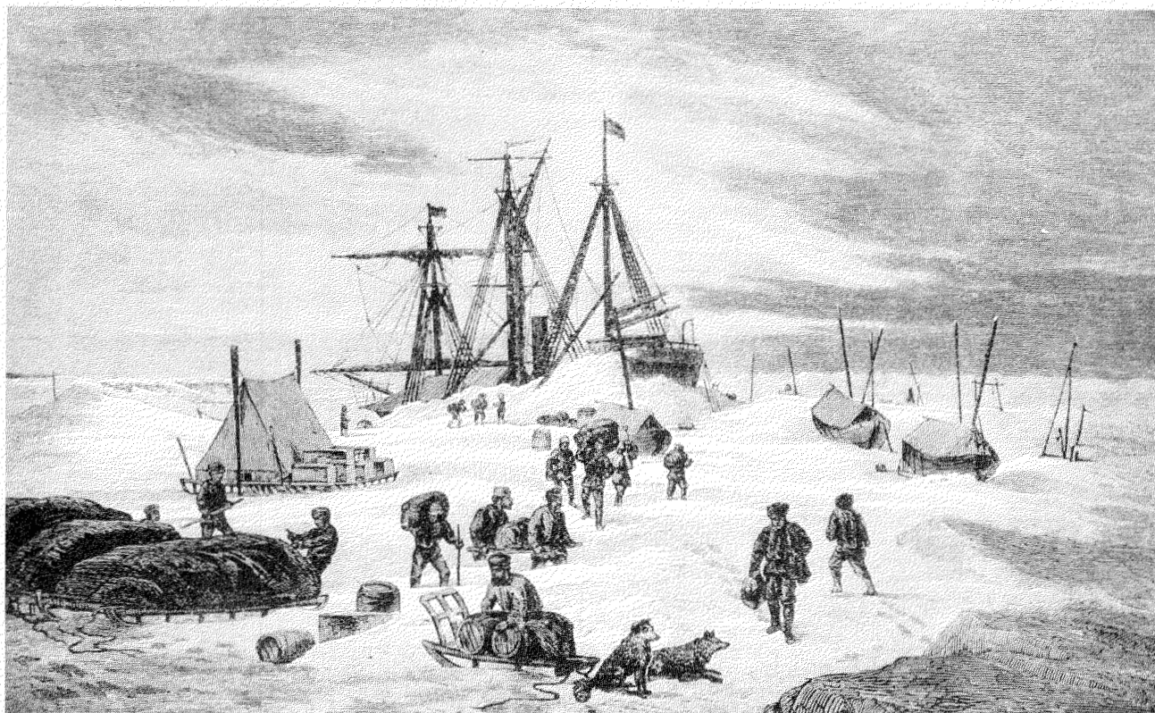
The first abandonment of the "Tegetthoff." Drawing by Payer.

to get to their depot and had to sail and row almost to its southern extremity before they were picked up by a Russian fishing vessel on 24 August 1874. The captain of this ship was paid to cut short his fishing and take them to the Norwegian arctic port of Vard. Payer later wrote a two-volume account of the expedition.