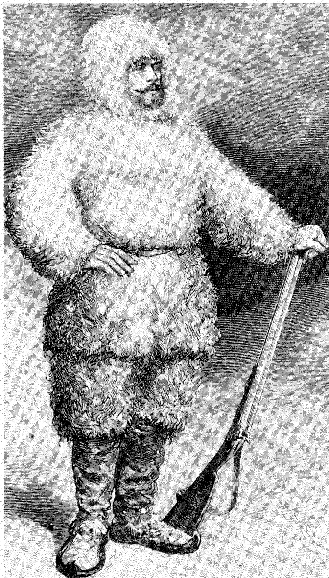
Payer, as depicted by a contemporary.

In September 1872 the Tegetthoff became ice bound and drifted northward over an irregular course. In August 1873 the southernmost island of Franz Josef Land was seen but could not be reached until October of the same year. Lieutenant Weyprecht commanded the ship and Payer led the sled expeditions that in early 1874 discovered the central portion of the island archipelago. During the drift of the Tegetthoff , on many occasions the ship's timbers groaned loudly as if it were about to be crushed by the ice. Each time the crew was prepared to lower their small boats and sleds onto the ice, each man having an emergency kit and rations ready.