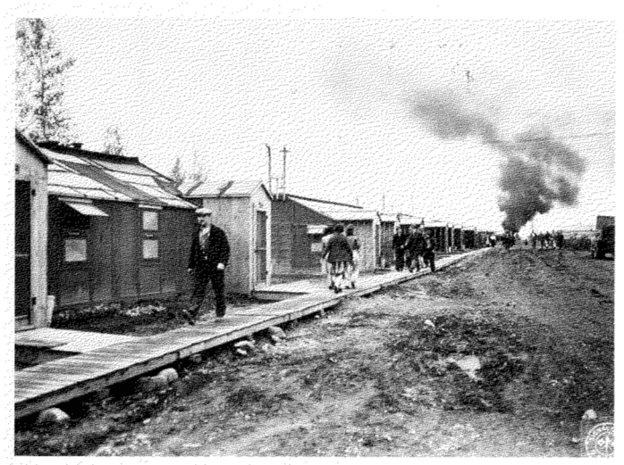
Main Street, Norman Wells camp.