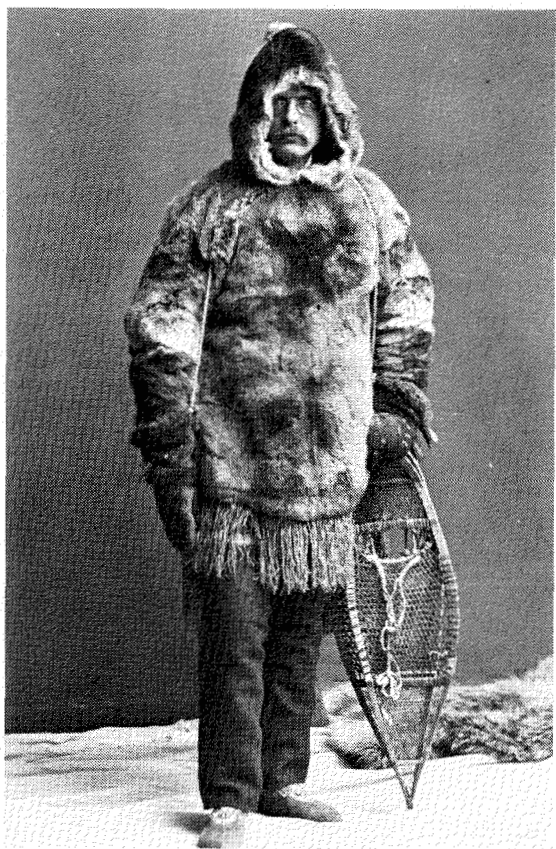
J.B. Tyrrell in Churchill, 1893, following his epic journey from Lake Athabasca to Chesterfield Inlet to Churchill via the Dubawnt River, Dubawnt Lake and Baker Lake.