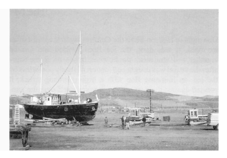
The Calanus being hauled to the sea.

After being beached for her second winter in Foxe Basin, the Calanus was sailed straight south to James Bay, to be used for the next two years in studies of James Bay and southeastern Hudson Bay. She then moved to northwestern Hudson Bay and, in 1962, sailed once again to Montreal for her second refit. This stay in the south lasted nearly three years because of problems with budget and bureaucracy.