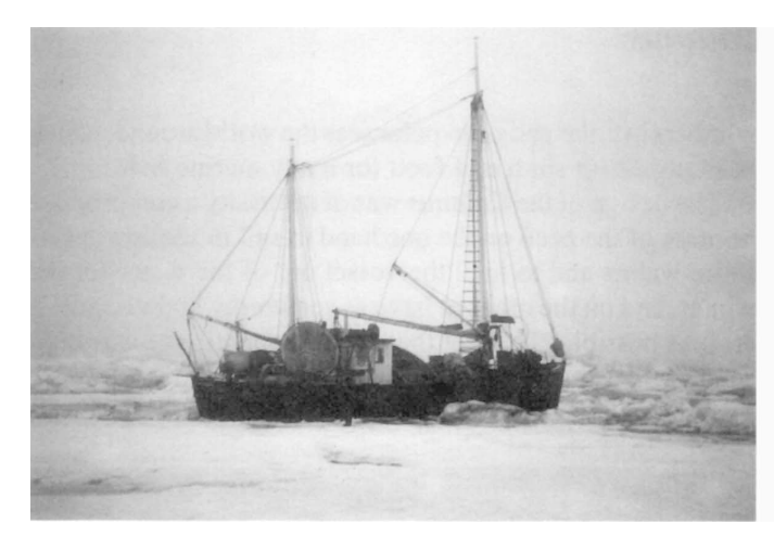
The Calanus in summer sea ice, Belcher Islands, 1959.

The Calanus was first used in 1949, for oceanographic work in Ungava Bay. During three summer seasons, her crew surveyed the currents, physical properties of the water, and animal populations of Ungava Bay, with the now interesting preliminary conclusions that marine fin fish, with the possible exception of the Atlantic cod, were likely to be of little importance in the bay, and that shrimp appeared to warrant more extensive examination.