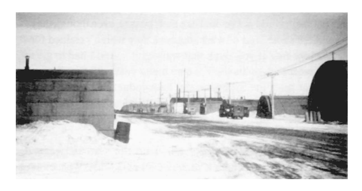
The Naval Arctic Research Laboratory, Barrow, Alaska, circa 1950s.

In 1944, the United States Navy launched a full-scale oil exploration program (PET4) in Naval Petroleum Reserve No. 4 (NPR4). The 90,000 km² reserve in northern Alaska, established in 1923, had gone relatively unnoticed since the initial exploratory and mapping work. Now, the previously remote Iñupiaq community of Barrow would become the Navy's PET4 base of operations for the next nine years. The town would be inundated with Naval personnel, barges, and heavy equipment as the Navy constructed a village of Quonset huts and laid a gravel runway 6 km north of town.