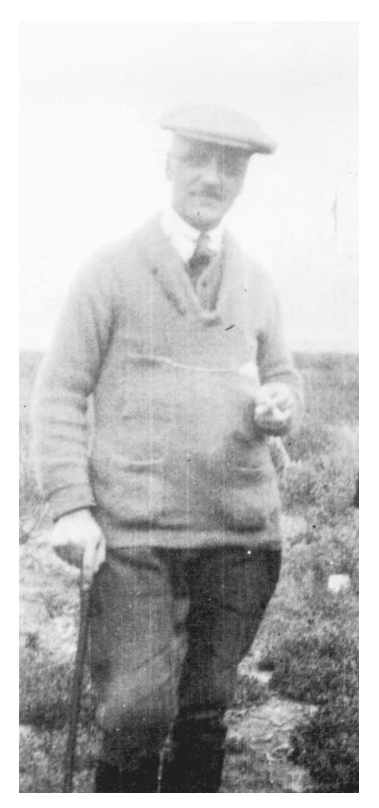
FIG. 5. Judge Lucien Dubuc, who presided at the trial of Alikomiak and Tatamigana.

Minister of the Interior, was his father. Presumably T.L. Cory was appointed for the defence partly because he drew a government salary and would not have to be paid extra for the task—Ottawa was very conscious of such costs in those distant days. Doubtless the trip to such an exotic locale appealed to him. But one would not have to be a conspiracy