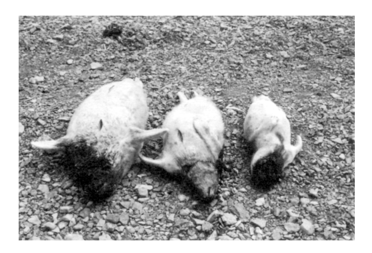
FIG. 2. Range of size and condition of ringed seal pups harvested in western Prince Albert Sound on 23 June 1998 (left, female BMI = 23.6, standard length 86.4 cm; center, female BMI = 17.2, standard length 77.5 cm; right, male, BMI = 16.8, standard length 64.8 cm; mean BMI for all pups sampled in June 1998 for which BMI could be calculated = 20.2, n = 44).

This poor condition of pups during June 1998 was noted by the seal monitor, who reported six seal pups in the June sample as "skinny" and in "poor condition," as well as reporting three seal pups washed up dead along the shore