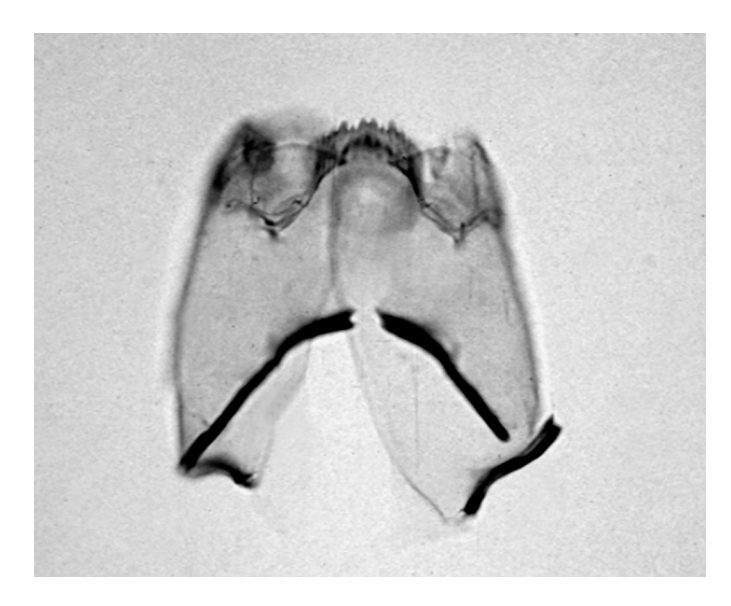
Example of a chironomid head capsule (K2 lake site).

recent studies in the northern Québec-Labrador region have sought to understand diatom distribution by examining lakes from different biomes (Fallu et al., 2000). In this region, diatom assemblages are good indicators of past water alkalinity, colour, and concentration of dissolved organic matter (DOM) produced from plant and animal decomposition.