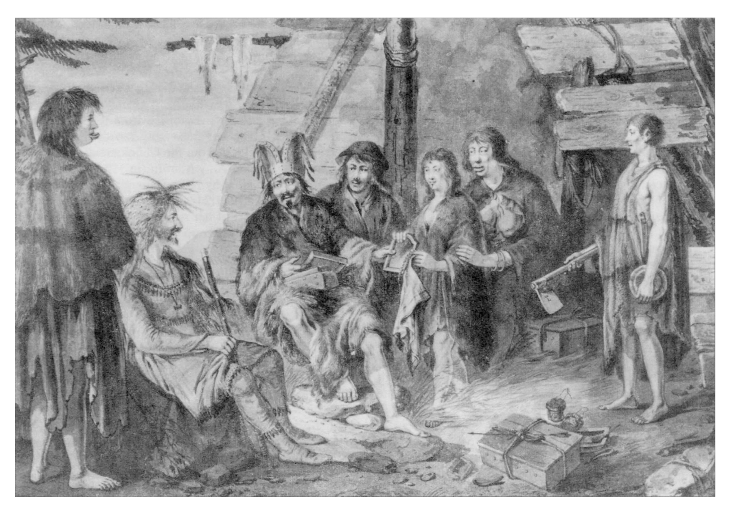
FIG. 2. "Costumes of the inhabitants of Port des Francais" (Lituya Bay), 1786, a drawing by Gaspard Duché de Vancy, artist with La Pérouse's expedition. The man sitting second from left wears a tailored costume resembling Athapaskan clothing then being worn inland, near the Yukon River.

identity is still unclear, he was probably traveling on one of the glacial routes between coast and interior. The Champagne-Aishihik First Nation in the southwest Yukon claims the territory where he was found, now within the Tatshenshini-Alsek Provincial Park, and has taken responsibility for working with government agencies and scientists involved in the analysis (Beattie et al., 2000). Early radiocarbon dates of 550 B.P. suggest that trade between coast and interior may have been underway by the 15th century. The hunter's finely woven hat resembles those that Tlingit residents at Lituya Bay were wearing when La Pérouse visited in July 1786. "The head," La Pérouse wrote, "they commonly cover with a little straw hat, curiously woven" (Milet-Mureau, 1799:401, 407), adding later that "hats and baskets of rushes are no where [sic] woven with more skill."