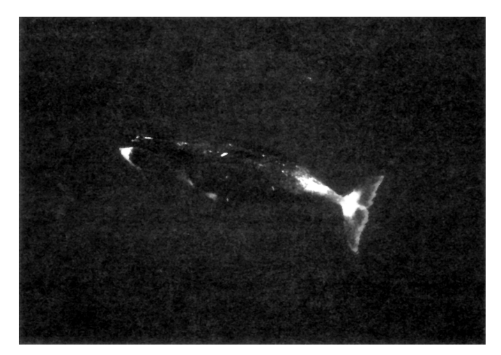
FIG. 2. Aerial photograph of adult bowhead, Isabella Bay, 28 August 1994. The amount of white on the tail and the degree of scarring indicate that the animal is old

Hudson Bay in August, observed a total 15 whales, most aggregated near Repulse Bay. Too few whales were observed to determine their density using line-transect methods, so an extrapolation was made from seven observations determined by inclinometer. This resulted in an estimate of 75, with a 95% confidence interval of 17–133.