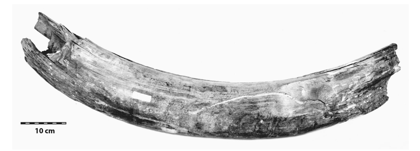
FIG. 4. Partial tusk of a mammoth (CMN 11833) from near Cape James Ross, Melville Island, Northwest Territories. It yielded radiocarbon ages of 21\ 000 \pm 320\ BP (GSC-1760) and 21\ 600 \pm 230\ BP (GSC-1760-2). It is the northernmost record of mammoths in North America.