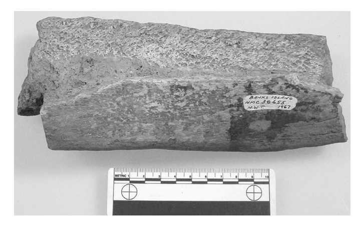
FIG. 3. Left tibia shaft (CMN 38655) of a mammoth from the Ballast Brook area, northwestern Banks Island, Northwest Territories. It yielded a radiocarbon age of 20 700 \pm 270 BP (T0-2355, normalized).

18000 BP (Dyke and Prest, 1986). If the animals had reached these areas several thousand years earlier, perhaps aprons of vegetated sediment in front of the advancing Laurentide ice might have made travel across these zones easier, particularly in the shallower depression between Beaufortia and Banks Island. A possible analogue is the crossing-by mammoths (Mammuthus sp.), American mastodons (Mammut americanum), helmeted muskoxen (Bootherium bombifrons), bison (Bison sp.) and other mammals-of large vegetated floodplains that evidently filled the Strait of Georgia about 30000 to 20000 BP in front of southerly moving glacial ice (Harington, 1975, 1996). Further, mammoths could have crossed sea ice, if it was thick enough. An added inducement to cross ice could have been the scent of distant vegetation carried on winds from the northeast. Tundra muskoxen are known to travel between various Canadian Arctic Islands across frozen sea ice at present (Miller et al., 1977).