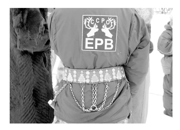
Reindeer herder from "Erv" wearing the traditional Nenets belt for men.

One of the most important tasks of the social impact assessment has been to highlight the mitigation measures that should be thoroughly studied in order to minimize any future harm and maximize benefits from planned and ongoing activities. The list of possible mitigation measures that the local inhabitants and reindeer herders discuss is long and quite detailed. Local stakeholders suggest that the measures should not be only for the short term; rather,