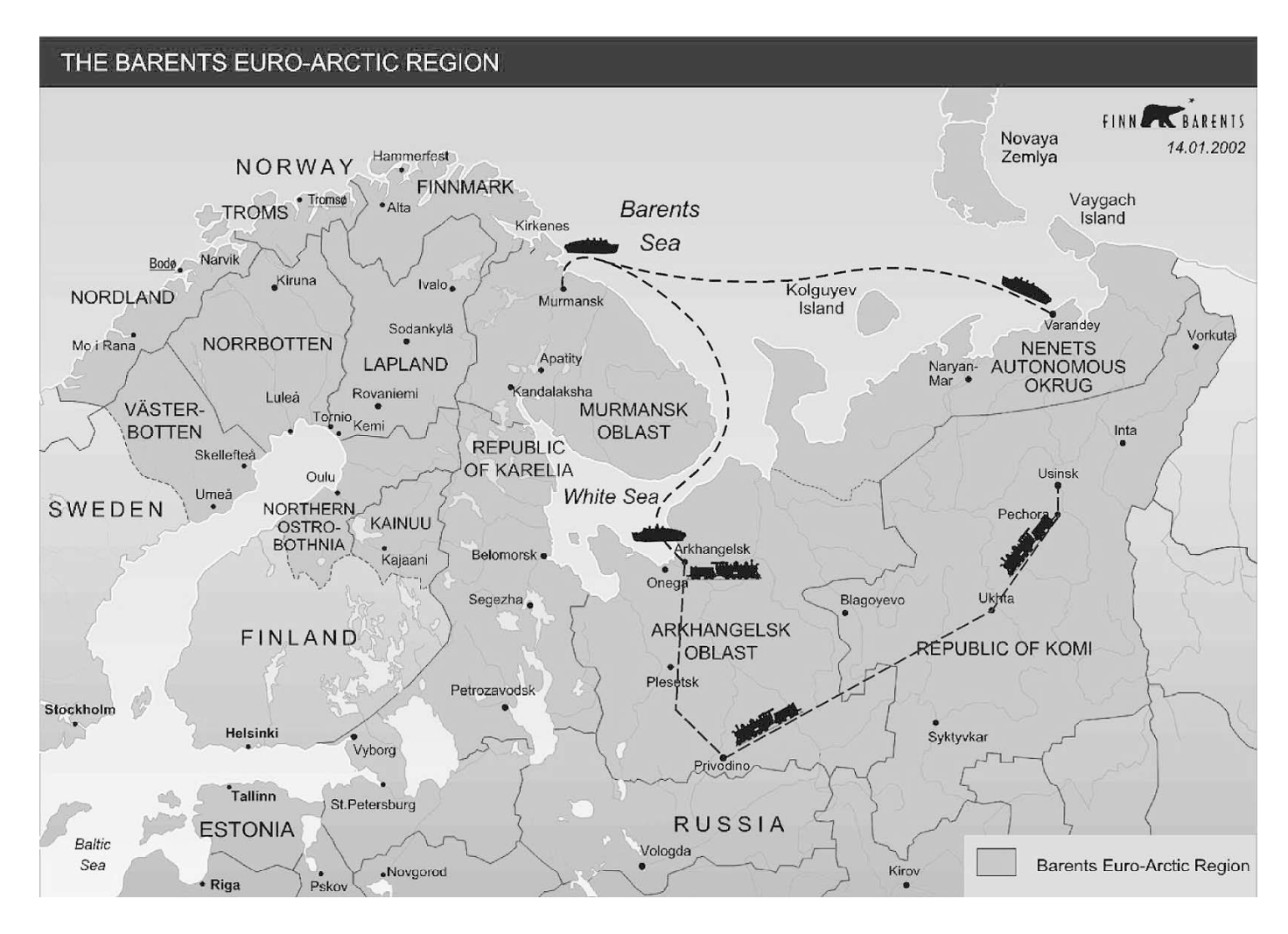
Current routes for oil transportation in northern Russia.

priorities); and to involve the affected communities in setting the boundaries of enquiry, defining impact measures and indicators, and identifying appropriate responses to anticipated effects.