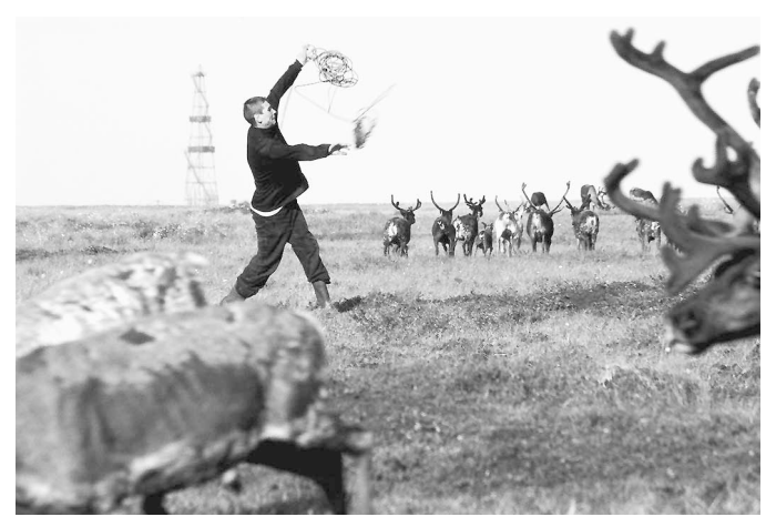
Oil tower in the vicinity of a reindeer herding camp on the Varandey tundra. Photo by Nina Meschtyb, August 2004.

Further development of the oil industry and marine transport will bring changes to the life of local and indigenous people. The balance between its positive and negative impacts will depend on a number of new factors. Significant among these are the ecological safety of oil loading and transportation; the environmental and social policies of the companies involved in the marine oiltransport system; and the attitude and policies of the regional administration.