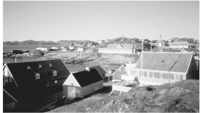
Part of the historic section of Nuuk, which housed the Danish IPY 1 observation station in 1882–83.

By offering its major event as a forum to enhance all IPY research with human components, IASSA follows logically on its initial leadership in making the wish to develop the agenda for social and human studies for IPY 2007–08 come true. In doing so, IASSA aims at fulfilling the main objective for which it was created 15 years ago, “to promote and stimulate international cooperation and to increase the participation of the social scientists in