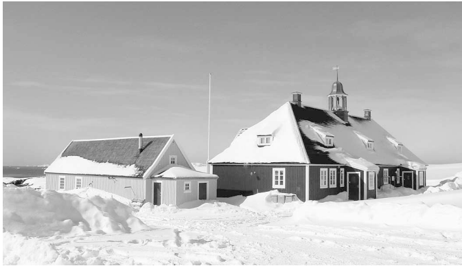
The historic New Herrnhut building (right) in Nuuk, Greenland, built in 1733, was still a Moravian mission when an IPY 1 observation station operated nearby in 1882–83. It currently houses the University of Greenland (Ilisimatusarfik), which is host to IASSA. A new “University Park” may be completed in time to host the Sixth International Congress of Arctic Social Sciences (ICASS VI), to be held in Nuuk during IPY 2007–08.

of 2007. ICASS VI will act as the major forum for the international community of Arctic social scientists to review its contribution to the overall IPY effort, discuss the status of the emerging social science programs under IPY 2007–08, and make plans for further action.