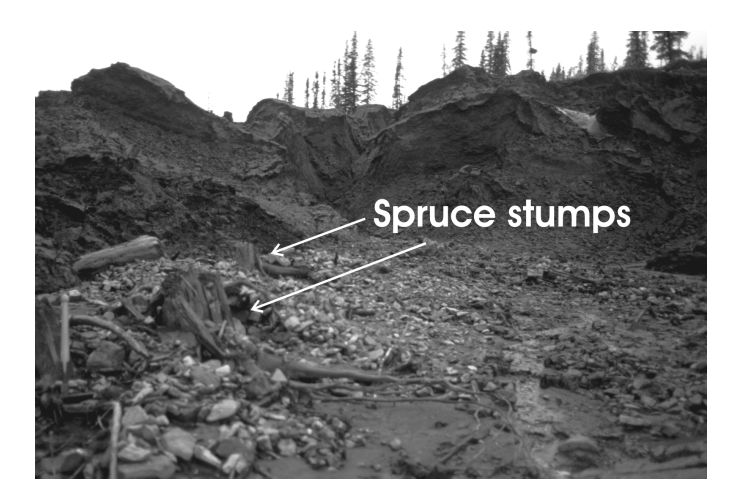
FIG. 4. Rooted in situ spruce stumps at exposure in Sixtymile River valley with ice-rich silt in background. Photo by C.R. Harington, 4 September 1985. This photo was taken at the same exposure, about one year after the 26\,080\pm300 <sup>14</sup>C yr BP year old spruce stump sample (Beta-13870) was collected.

the pollen assemblage. However, rare Picea needles and associated Picea stomates indicate that scattered spruce trees persisted locally in the herb-dominated vegetation. Trees were present even though spruce pollen frequency is consistently less than 10% and most often under 5% during this interval (Vermaire, 2005). Unfortunately, chronological and stratigraphic problems at Antifreeze Pond do not permit precise timing of paleoecological changes during MIS 3 and MIS 2.