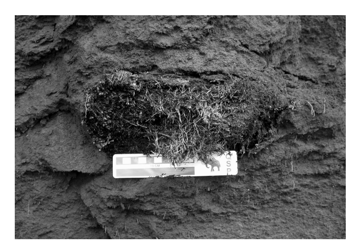
FIG. 2. Fossil arctic ground squirrel midden (GZ.05.34) from Quartz Creek site.

The history of spruce trees in Eastern Beringia during the Middle Wisconsinan interstadial (MIS 3 = ca. 65000– 25000 yr BP) is complicated by chronological uncertainties and limited sites (Anderson and Lozhkin, 2001). MIS 3 climates are generally considered warmer than those of MIS 2 (Begét, 1990), and paleoecological data suggest that open spruce forests became established in Yukon Territory and interior Alaska, but did not reach their modern latitudinal or longitudinal limits (Anderson and Lozhkin, 2001). This vegetation may be best described as a forest-tundra mosaic and not the dense boreal forest that typifies the interior regions of Alaska and Yukon today. Spruce probably formed open stands in sheltered valleybottom settings within regional tundra-type vegetation