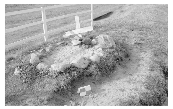
FIG. 4. Grave of Hector Pitchforth prior to excavation.

In 2004, responding to a request from the community, and with the permission of relatives of the deceased, the Government of Nunavut undertook the exhumation of the remains and their reburial in a location where the impacts from human activity would be reduced and the threat from erosion eliminated. The work was conducted under the Nunavut Archaeology Program, established in 2002 by the Department of Culture, Language, Elders and Youth (CLEY) as a means to help communities manage, investigate, and protect archaeological resources. Under this program, the department has conducted projects in eight Nunavut communities, including site inspections, development impact assessments, community site surveys, and full-scale excavations. This project was the first exhumation and reburial under the program. The provision of archaeological training and employment opportunities for Inuit is a key component of the Nunavut Archaeology Program, and in 2006 a multiyear archaeology field training program commenced in partnership with the Inuit Heritage Trust.