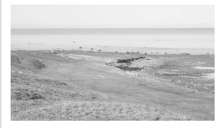
FIG. 3. View of site selected for reburial (flat area in foreground). The existing gravesite can be seen in the distance.

but did not act on the idea of moving the graves (P. Ootoowak, pers. comm. 2005).