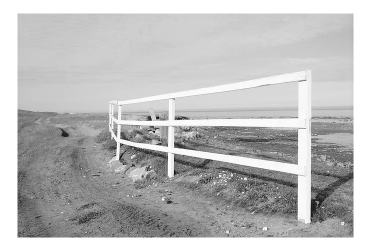
FIG. 1. Fence erected by community volunteers along allterrain vehicle trail to protect the Janes and Pitchforth gravesite near Mittimatalik (Pond Inlet).

The level of human activity in the vicinity of the graves, combined with the fact that they are shallow and dug into fine sand, has made them susceptible to damage arising from cultural and natural activities. Over time, the rocks and sand covering the Pitchforth grave were removed, and damage to the coffin lid exposed the contents to the elements and to the curious-minded. The grave markers had also fallen (or been removed), and for a brief period, they