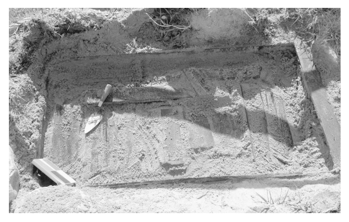
FIG. 5. View of Hector Pitchforth grave showing loose boards from original lid.