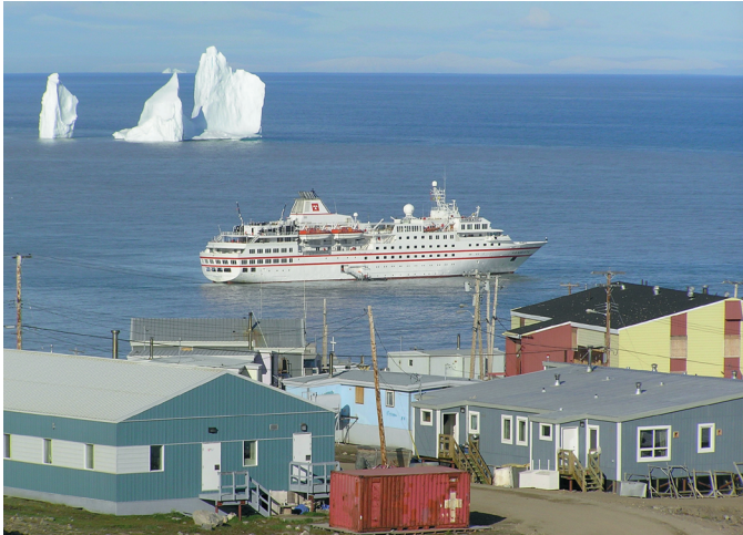
FIG. 3. The Hanseatic cruise ship visiting Pond Inlet, Nunavut, in August 2006.

portion of the archipelago (Agnew et al., 2001; Alt et al., 2006; Howell et al., 2006).