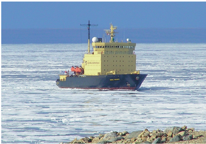
FIG. 2. The Kapitan Khlebnikov cruise ship visiting Cambridge Bay, Nunavut, in July 2005.

Clyde River on Baffin Island, for example, has decided that the positive effects of cruise visitation do not counter the negative effects, although one cruise ship did schedule a visit in 2006. For Clyde River the question remains: How are cruise visitors managed if the community has decided they are not welcome?