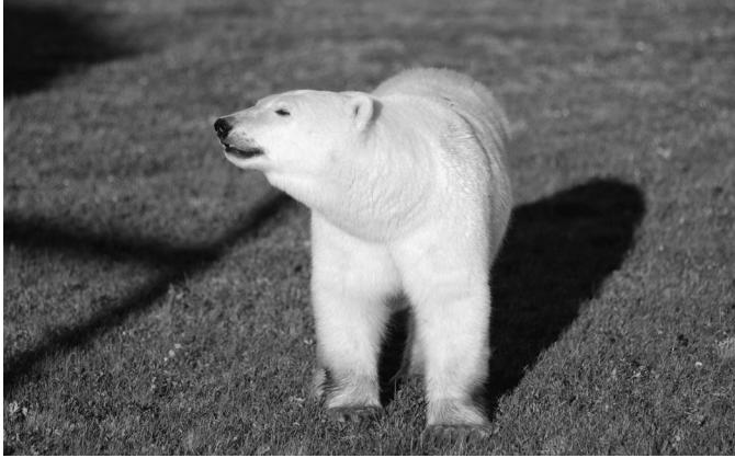
FIG. 3. Polar bear on land during the summer fasting period in western Hudson Bay.

the complex relationships between sea ice extent and the life history traits and population dynamics of polar bears. The results of this study are expected to provide critical insight into the individual and population-level response of polar bears to rapidly changing sea ice conditions in the Canadian Arctic. Furthermore, because the western Hudson Bay polar bear population is located at the southern limit of the species' range, this study will serve as a litmus test for how other polar bear populations are likely to respond to changing sea ice conditions throughout the Arctic. Finally, it is expected that the results from this study will provide a unique look into how long-term variation in the availability of essential prey resources can influence the life history and persistence of a long-lived carnivore species.