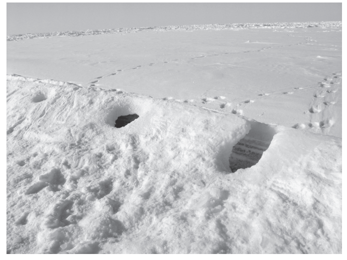
FIG. 4. Examples of sites where polar bears dug through solid ice to try to capture a seal in the air space below.

confirmed she had suffered a substantial blow to one side of her head. Bites to the throat had shattered the larynx and broken a lateral piece off the atlas vertebra. The area was snow-covered, so no tracks were visible, but it is likely that only an adult male polar bear would have been capable of killing an adult female in this way.