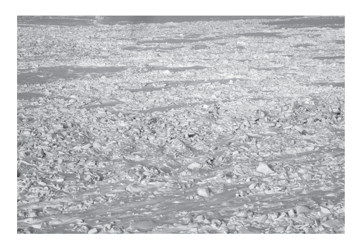
FIG. 2. Example of extended rubble field in the sea ice offshore from the coast in the southeastern Beaufort Sea.