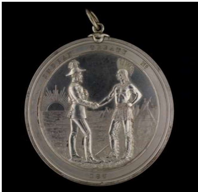
Indian Chiefs Medal

Note. Medals like this one were presented in the name of Queen Victoria to commemorate Treaties 3, 4, 5, 6, 7, 8 (Library and Archives Canada, n.d.).