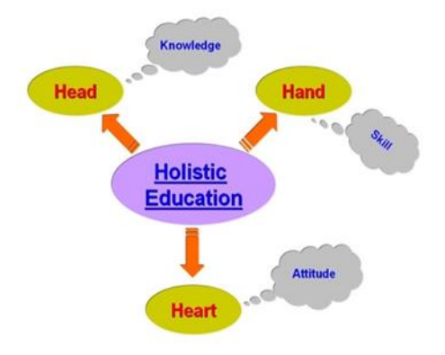
Figure 1. Heart, hands, and head model

The heart-hands-head model corresponds to the holistic approach of the Swiss pedagogue Johann Heinrich Pestalozzi (1746-1827), and is designed to encourage the development of wellbalanced children who would grow to become responsible citizens. For Pestalozzi, empowering and ennobling every child was the only way to improve society and bring peace and security to the world. He sought to develop a complete theory of education that would promote happiness for humankind (Johann Heinrich Pestalozzi, n.d.). The model has been used in many