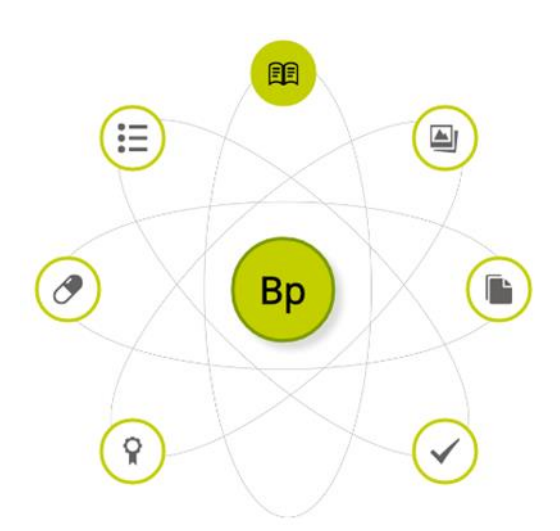
Figure 3. Atom-shaped organisation of effective science teaching practices using artifacts.

Each practice is presented with a complete description or lesson plan, followed by photos of students' work and lesson handouts (for the students and/or the teacher). In many lessons or projects, the assessment method is explained in detail, and, if required, assessment documents or matrices are included. Also made available, for specific lessons or projects, is a scientific capsule which describes and explains the main scientific concepts relevant to the learning activity. In some cases, a list of Internet links used in the activity, or as a complement, is also provided. Each lesson or project includes a diagram of the relevant set of effective science teaching criteria. Each practice has several characteristics; in general, at least five out of the nine criteria characterized each lesson or project. Finally, the names of the teachers who shared the practices, as well as references, are provided.