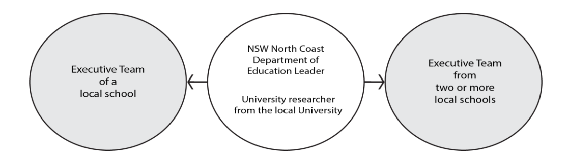
Figure 2: An Australian External Team comprising a Department leader and a university researcher. Once a month the External Team met with school teams.