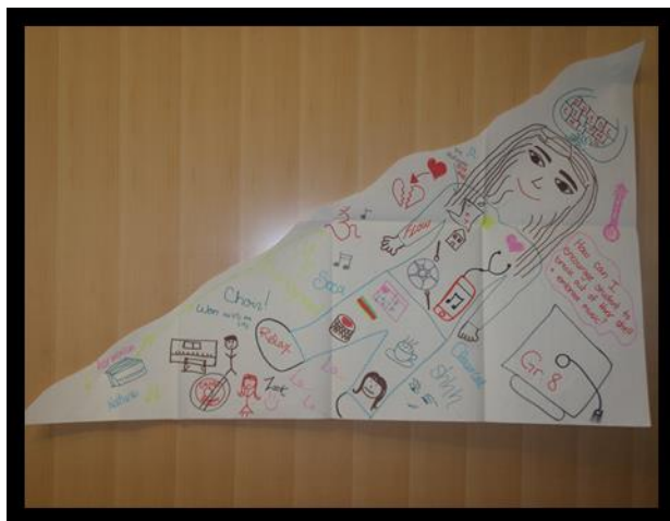
Figure 1. Alex's Body Map

Following the creation of the body maps, I invited students to orally reflect with their partner on the process. After a few minutes of discussion, students offered their thoughts on the body mapping experience with the entire class. Teacher candidates were invited to take their body maps home and create a 2-page written reflection to submit the following class. This