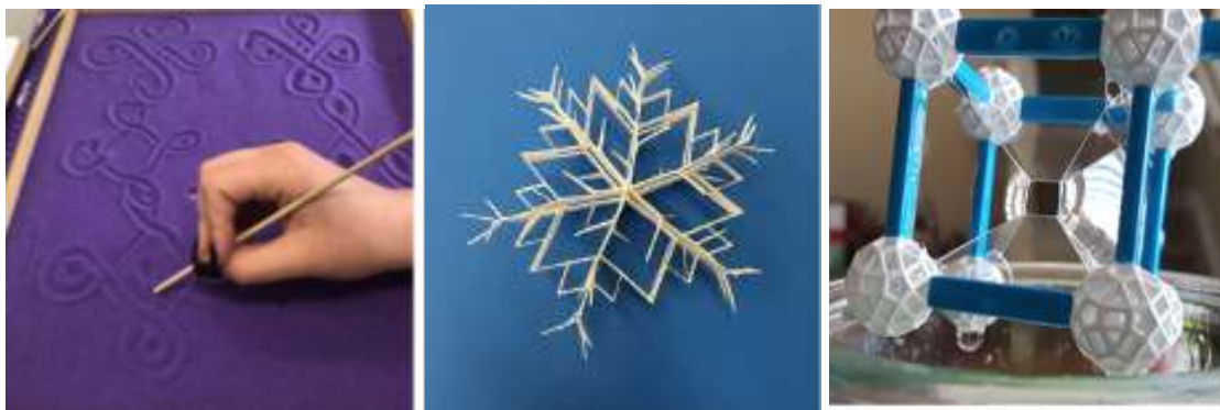
Teacher Candidates' Sand Drawing, Paper Snowflake, and Bubble Minimal Surface