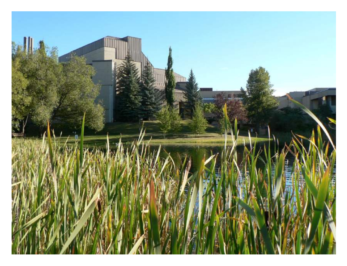
Figure 1. Mount Royal University, Calgary, Alberta, Canada