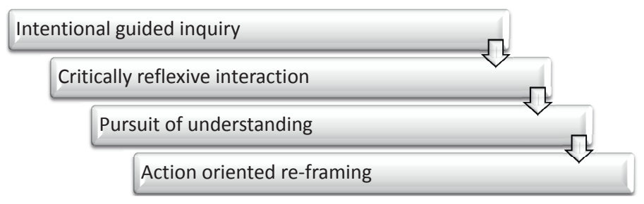
Figure 2: A synthetic approach to internationalization

are not organs of the common will, who are outside of the political society in which they live, and are, in effect, aliens to that which should be their own commonwealth. Not participating in the formation or expression of the common will, they do not embody it in themselves. Having no share in society, society has none in them. (Dewey, 1897/1969, pp. 237-238)